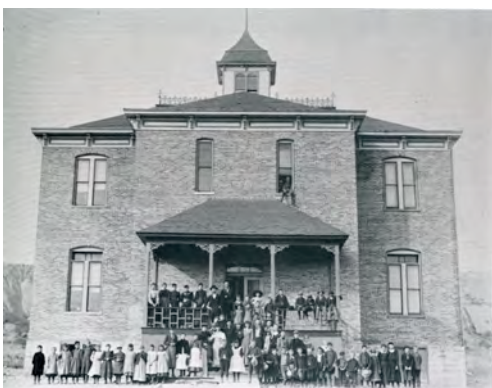
First schoolhouse – 1910